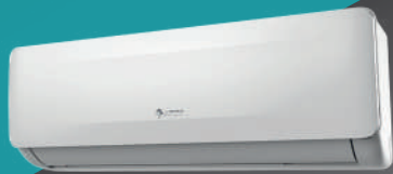
Wall mounted airconditioning units multi split

Connection of one outdoor unit with multiple airconditioning units of different types